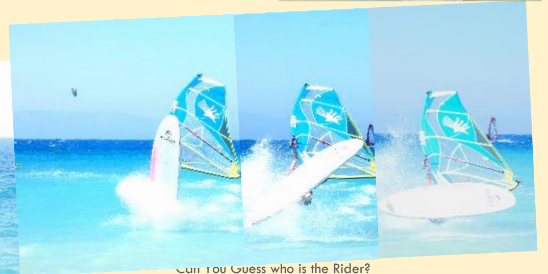
Can You Guess who is the Rider?