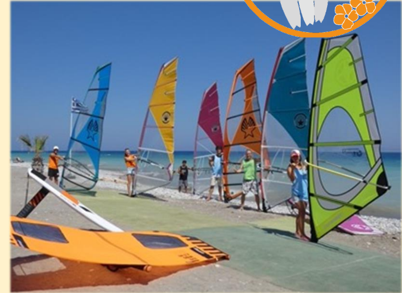
Ezzy 2022 Sails Parade

We are really happy that we already met some of you this season, and are also looking forward to spend time with all of you who will come during the summer.